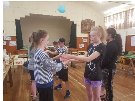
Year 7 & 8 Zone Camp

Johnstone Contracting – Now offering boom and hand gun spraying services. Boom spraying vehicles available now and ready for the coming season. Give your local contractor a call now to discuss or to book in. Small Digger also available. Ph / Txt 027 454 9024.